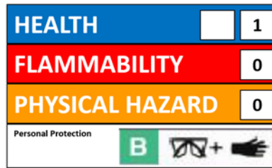
HMIS (Hazardous Material Information System)