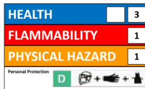
HMIS (Hazardous Material Information System)