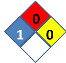
NFPA (National Fire Protection Association)

Information contained in this publication or as otherwise supplied to Users is believed to be accurate and is given in good faith, but it is for the Users to satisfy themselves of the suitability of the product for their own particular purpose. Catexel Nease LLC gives no warranty as to the fitness of the product for any particular purpose and any implied warranty or condition (statutory or otherwise) is excluded except to the extent that exclusion is prevented by law. Catexel Nease LLC accepts no liability for loss or damage (other than that arising from death or personal injury caused by defective product, if proved), resulting from reliance on this information. Freedom under Patents, Copyright and Designs cannot be assumed.