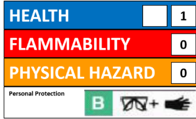
HMIS (Hazardous Material Information System)